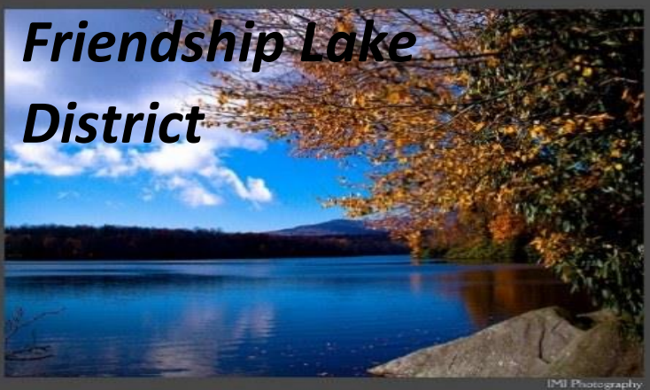
IMI Photography April 2018